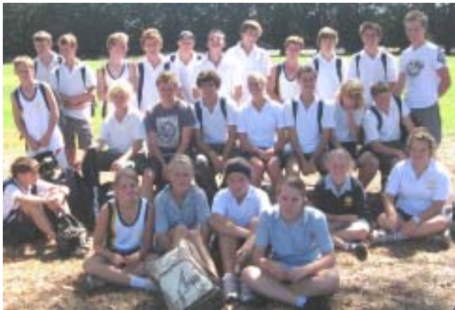
Above: The BSC Triathlon teams.