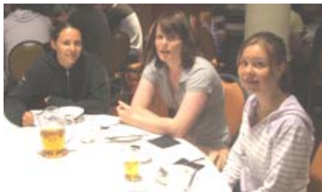
Photos: Our VCE students enjoyed their taste of university life during their recent study camp. They had the opportunity to engage in a variety of subject areas for possible future university courses such as the human movement physiology studies as seen below.

The focus for our Year 12 students is now on working productively both at school and home to gain the best possible results for 2009.