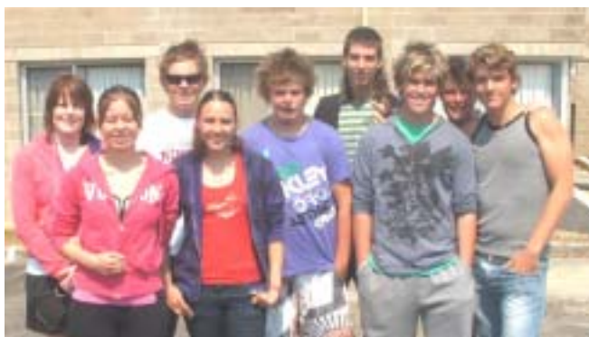
Above: Some of our VCE students outside one of the accommodation buildings at UB's Mt. Helen campus.

PARENTS & FRIENDS ASSOCIATION Annual General Meeting will be held on Wednesday, 4th March at 7.30pm All parents, especially new families, are welcome and encouraged to attend.