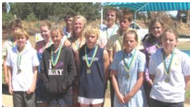
Above: The Age Group Champions following the medal presentation. Congratulations to each of you.