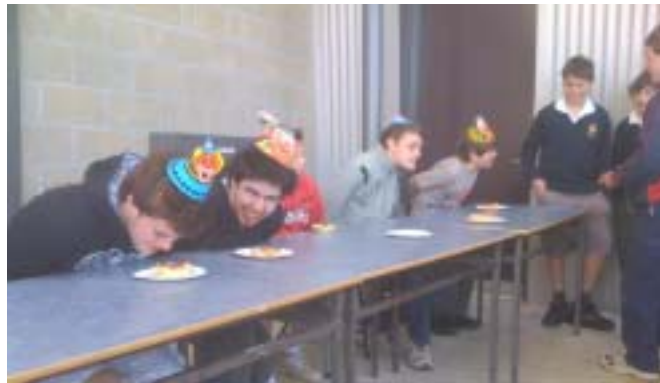
Top: Students gather to cheer on the contestants.