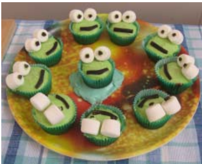
Some more creative designs in cup-cake decoration.

Good luck to all our students and staff who are participating in finals over the next few weeks in local football and netball competitions.