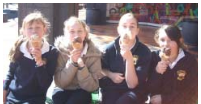
Below: The girls enjoying their ice-cream treats.