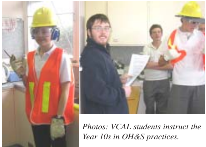
Photos: VCAL students instruct the Year 10s in OH&S practices.

All VCAL students delivered quality lessons which were interactive, fun and informative.