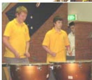
Photos Our musicians during their playout at the Beaufort Day Care Centre and with the Ballarat Grammar School band.