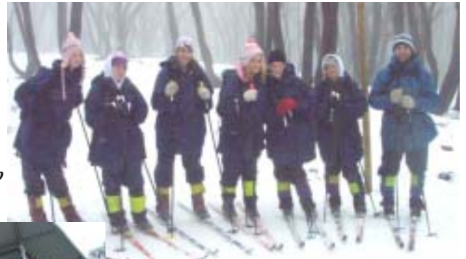
Hiking, cycling, skiing and fun - Rubicon Camp had it all.