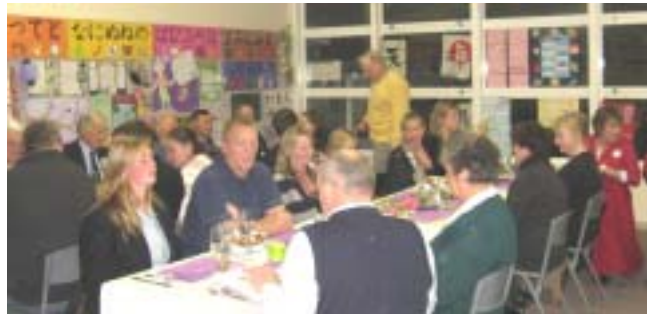
Above: Rotarians and guests enjoy the hospitality of the Beaufort Secondary College for their weekly dinner meeting.