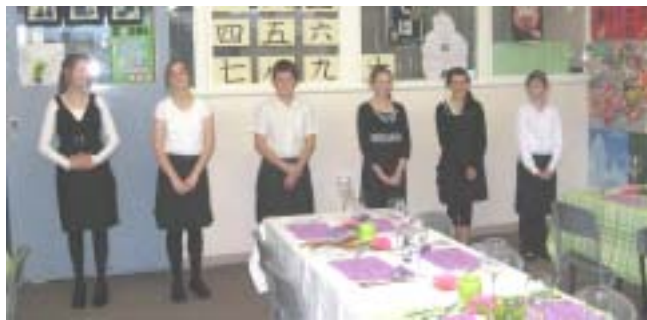
Below: The Year 7's introduced themselves and presented the menu to the dinner guests.