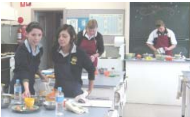
Above: SRC students prepare the morning tea.