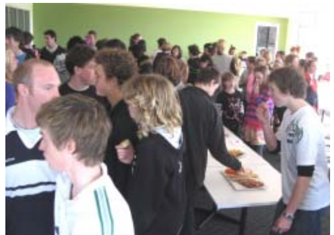
Right: The morning tea was well supported by students & staff. (More photos Page 4)