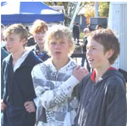
Below: Peta competed in a number of events.