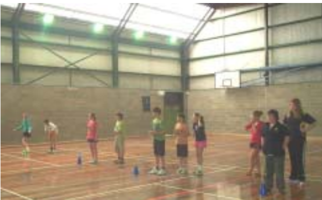
Photos: Above and below - Year 7 students enjoy their PE classes in the Gym.