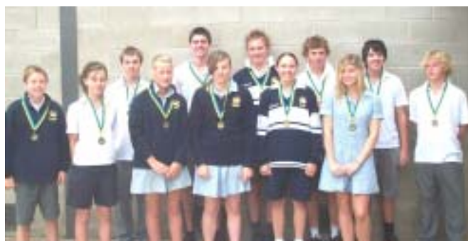
Above: The Age Group Champions following the presentation of their medals.

Again, thank you to all the parents who came along and support the students and to all the staff and students who helped out on the day, it is greatly appreciated. To all the students who participated, well done.