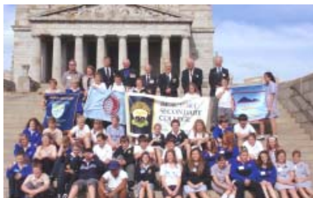
Above: Our students at the Shire of Remembrance in Melbourne.

The service was poignant and respectful and gave our students the opportunity to reflect on the hardships and sacrifices made by countless Australian men and women in the defence of our country and our freedom.