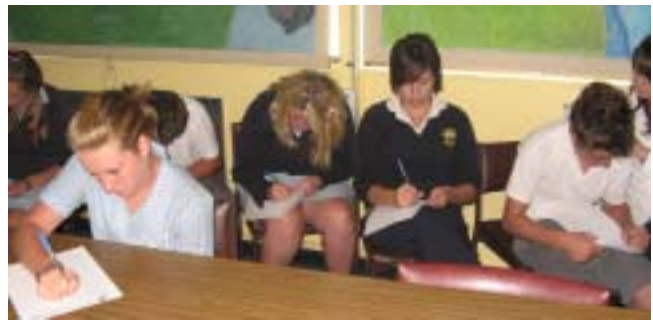
Above: Our students make notes during their visit to PINARC.

During our visit, two of the PINARC clients gave us a presentation on their life journey. It was very insightful. This visit was a valuable experience for our students and our school will certainly be keen to visit PINARC again next year.