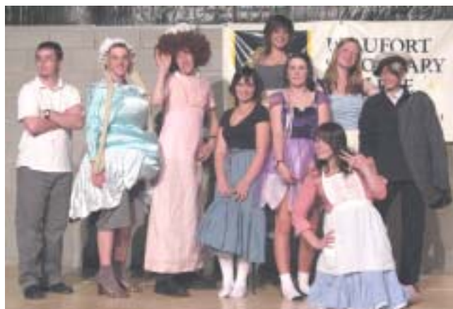
Above: The cast of Red Hot Cinders .

Well done everyone in the 9/10 Drama class.