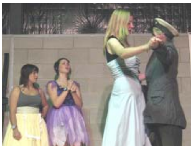
Photos The much loved fairy tale of Cinderella, as told by the Year 9/10 Drama class in ' Red Hot Cinders '.