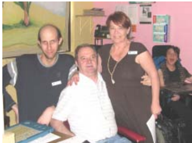
Below: Some of the PINARC clients and carers.

FRIDGE POCKETS $4.00 each A handy magnetic A4 plastic pocket to hang on your fridge door for notices and reminders. Available from the General Office - NOW